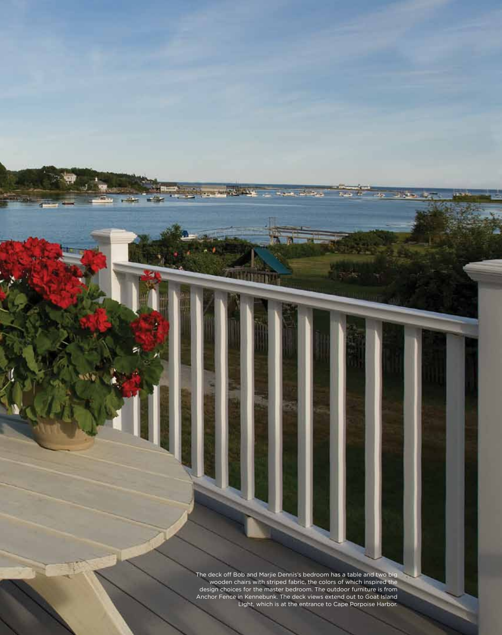
The deck off Bob and Marjie Dennis's bedroom has a table and two big wooden chairs with striped fabric, the colors of which inspired the design choices for the master bedroom. The outdoor furniture is from Anchor Fence in Kennebunk. The deck views extend out to Goat Island Light, which is at the entrance to Cape Porpoise Harbor.